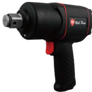
PW-7604 Mini Type Extreme Composite 3/4" Air Impact Wrench