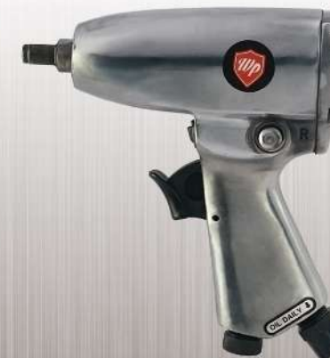
PW-0307 3/8" Heavy Duty Air Impact Wrench