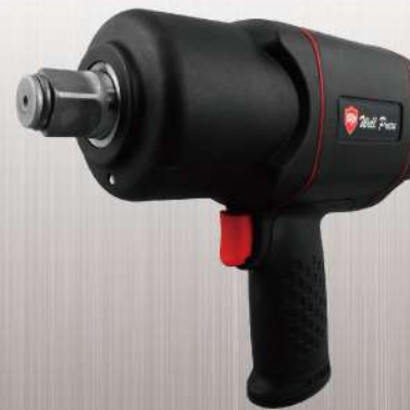
PW-7603 Extreme Composite 3/4" Air Impact Wrench