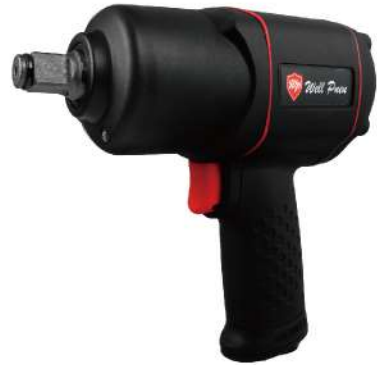
PW-7421 Extreme Composite 1/2" Air Impact Wrench