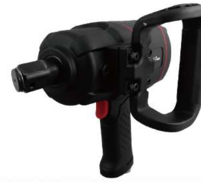
PW-7801 Extreme Composite 1" Air Impact Wrench