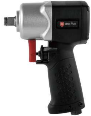
PW-7410 1/2" Mini Composite Air Impact Wrench