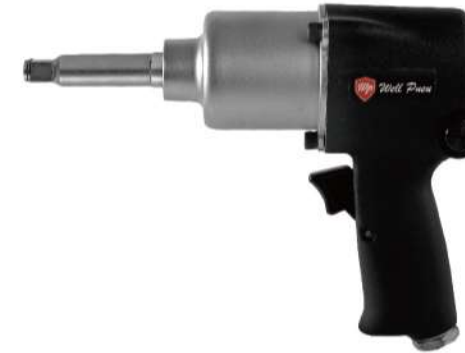
PW-0460 1/2" Heavy Duty Air Impact Wrench with 2" Extended Anvil