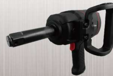
PW-7860 Long Anvil Extreme Composite 1" Air Impact Wrench