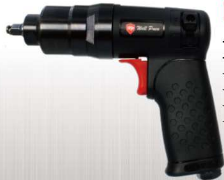
PW-7206 3/4" Composite Air Impact Wrench