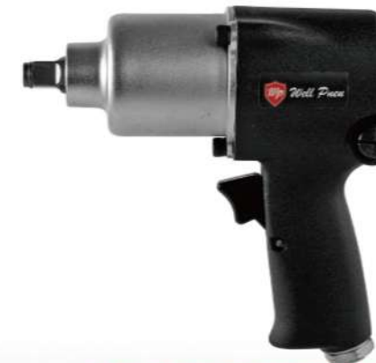
PW-0401 1/2" Heavy Duty Air Impact Wrench