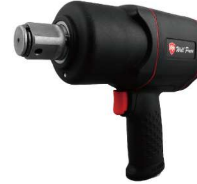
PW-7802 Mini Type Extreme Composite 1" Air Impact Wrench